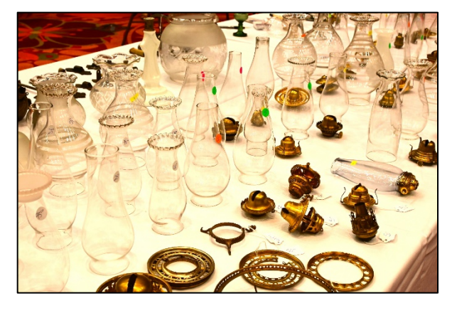
Kerosene Burners, Chimneys and Shade Holders