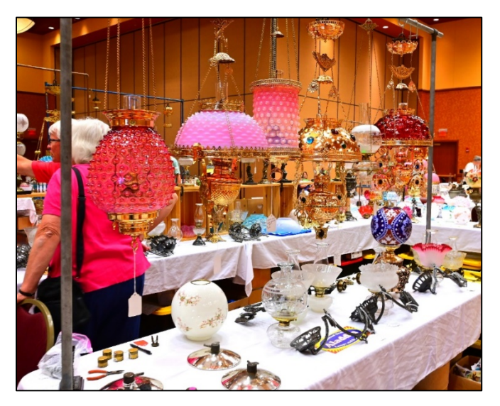
Victorian and Early Lighting was Plentiful