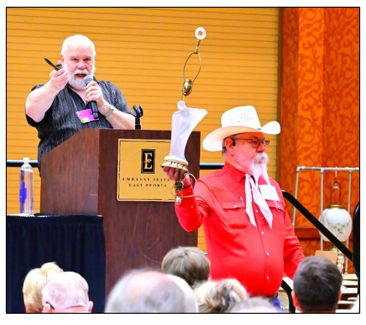
An Aladdin "Lady & Cape" Electric Table Lamp Sold for $1,300 at the Auction