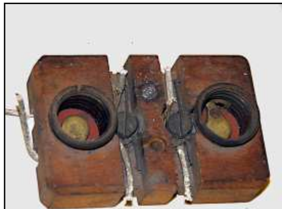
Early Edison Wooden Fuse Holder